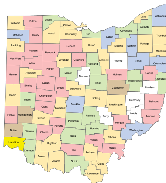
Waterbodies (with advisories) per county: