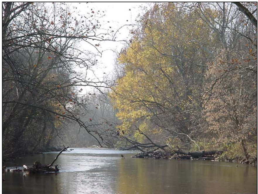
Mad River in autumn at County Line Road

areas: the headwaters; Mad River between Kings and Chapman creeks; Buck Creek; Mad River from Chapman to Mud creeks; and the lower Mad River draining into the Great Miami River in Dayton (see map on page 2).